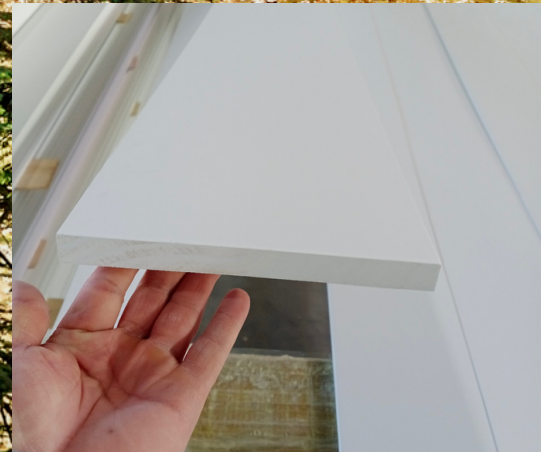
FINGER JOINTED PRIMED BOARDS